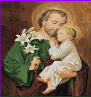
Saint Joseph, pray for us.