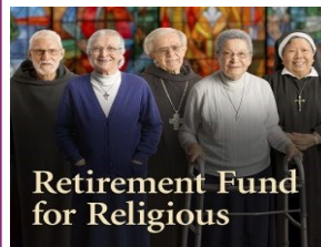
Retirement Fund for Religious

TUESDAY, DECEMBER 13, 2022 7:00 PM AT GATE OF HEAVEN CHURCH, DALLAS. A NUMBER OF PRIESTS WILL BE AVAILABLE TO HEAR CONFESSIONS. ALL ARE WELCOME!